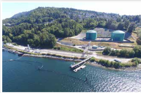
Photo top: Over 5,000 people attend anti Kinder Morgan rally in Vancouver.