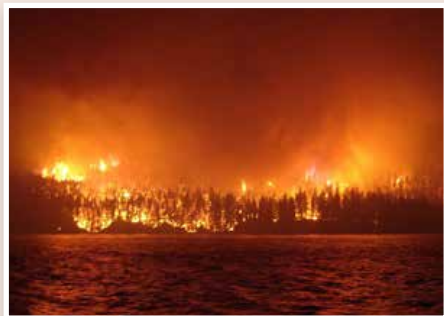
Photo: Ashcroft Reserve wildfire burning at Loon Lake, BC (Creative Commons, Shawn Cahill).

By the time it was over, the province spent a record $750 million fighting the wildfires and for relief efforts. 8 We lost more than 500 homes and businesses. And it wasn't just here. Last year, unprecedented wildfires tore through New Zealand, Chile, Brazil, South Africa, Siberia, across southern and eastern Europe and the western United States, killing at least 168 people. 9