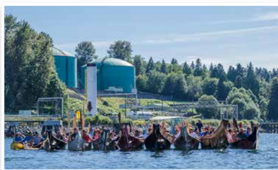
Photo: First Nations canoes in front of Kinder Morgan's terminal in Burnaby, BC (Michael Wheatley).