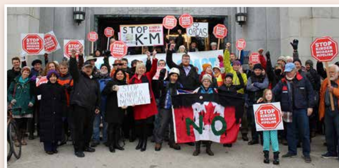
Photo: Kinder Morgan protest in front of Vancouver law courts (Rabble.ca).

All over the world, people are suffering the effects of climate change without being able to do anything about it. But we have a chance here in British Columbia to make a real difference. We can and will stop Kinder Morgan's pipeline and we'll have a brighter future for it.