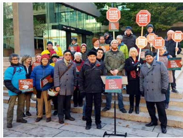
Support for Squamish Nation at Vancouver law courts.

It's important to remember only one of these cases needs to succeed to overturn the decision and delay, and even stop the project. Kinder Morgan, on the other hand, needs to win every legal argument to move their pipeline forward.