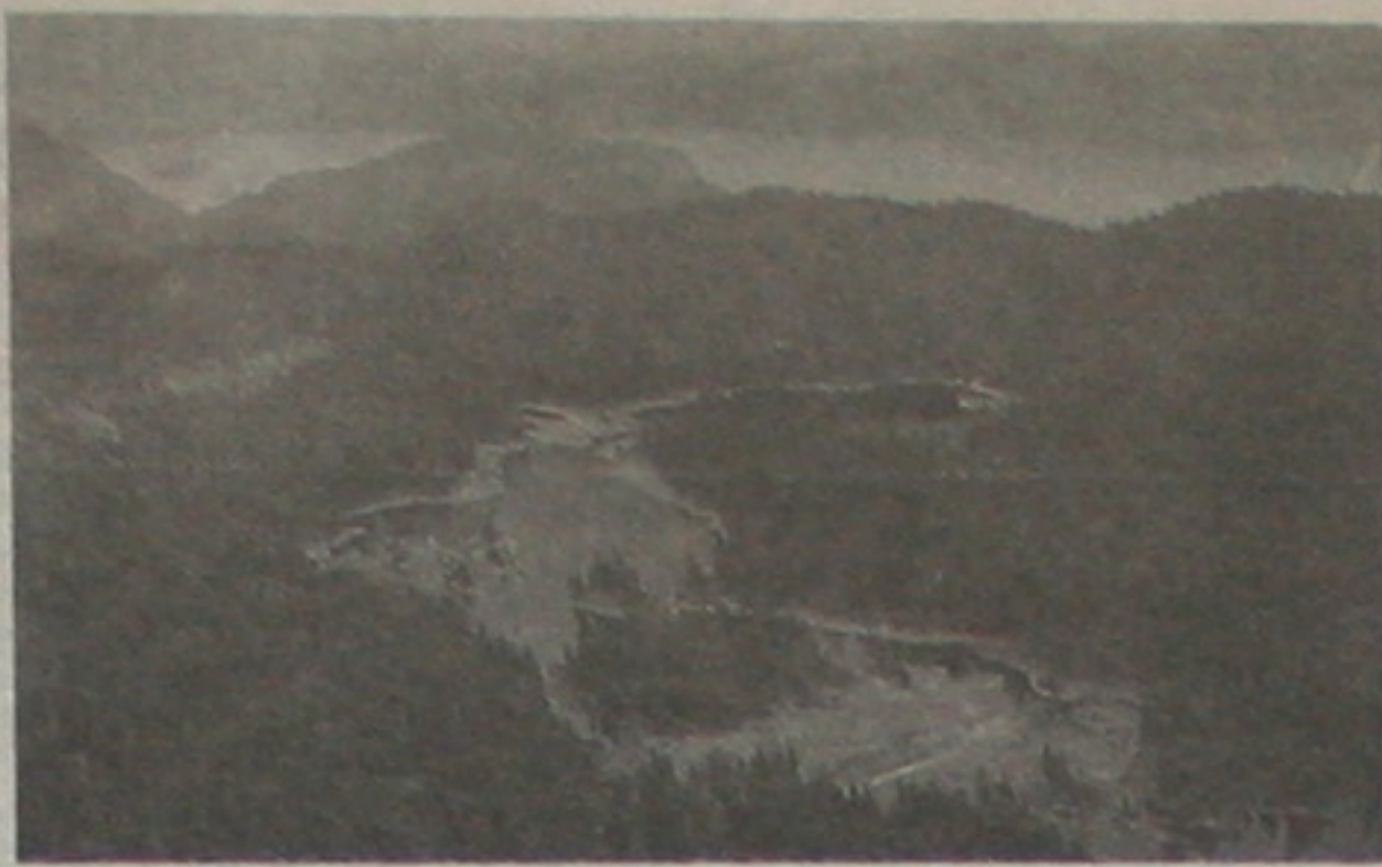
Monroe Lake on Burke Mountain. Graham Osborne

* '93 directions - WCWC's volunteer trail builders will complete the "Fool's Gold Trail" by clearing another 20 kilometres starting in the spring of 1993, making it possible to hike through wilderness from Coquitlam to Squamish! WCWC will work to see the B.C. government, under the Protected Area Strategy (PAS) process to make Pinecone Lake/Burke Mountain into a provincial