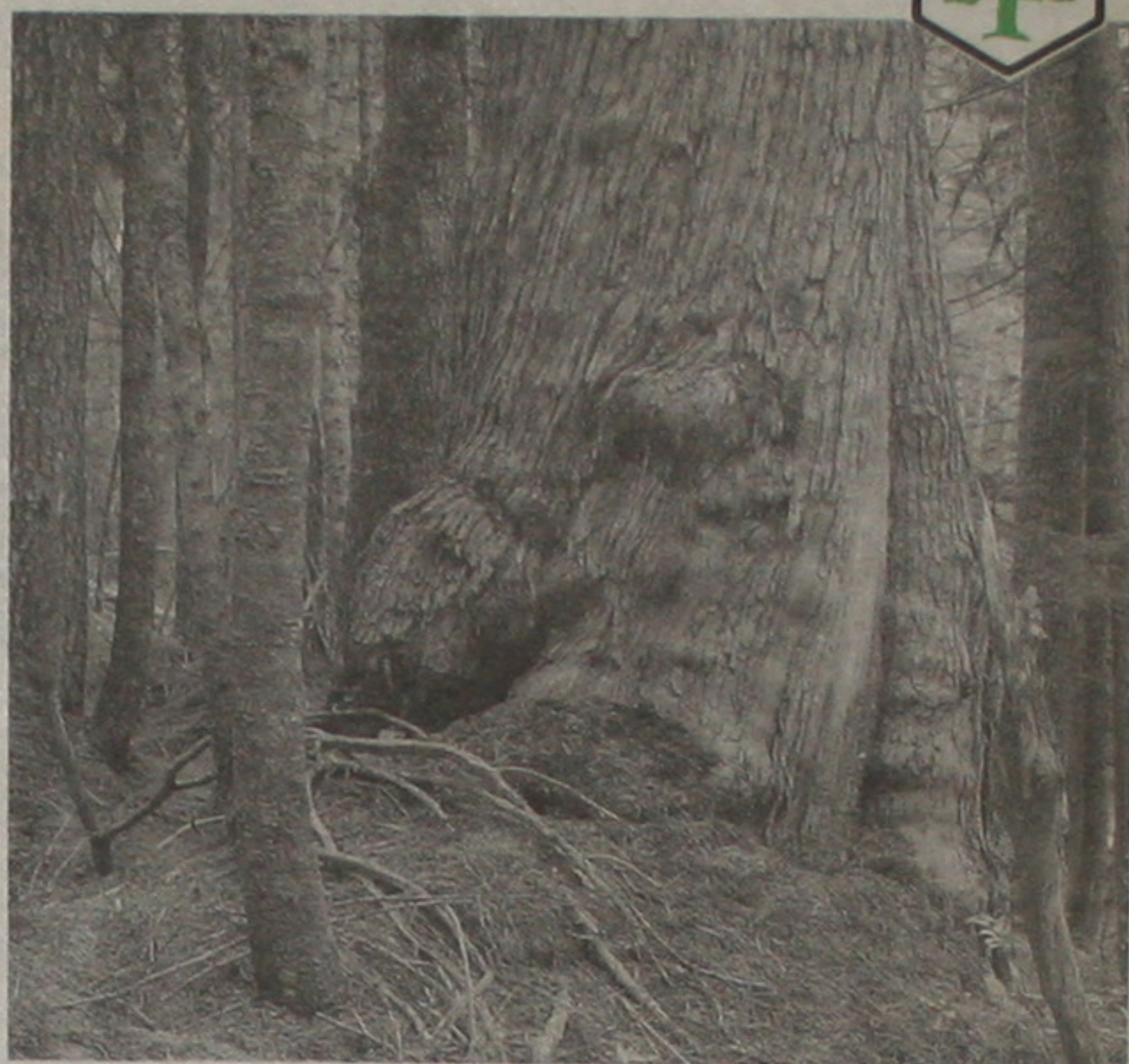
Ancient yellow cedar in Caren Range on the Sechelt Peninsula.