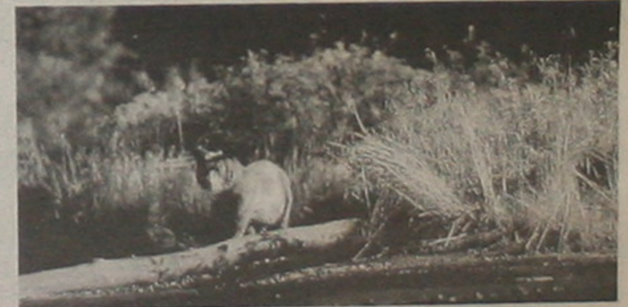
Grizzly Bear in now preserved Khutzeymateen Valley.

* What you can do - Write B.C. Environment Minister, John Cashore, Legislative Buildings, Victoria, BC V8V 1X4. Phone (604) 387-1187 or fax (604) 387-1356. * Local Environment group to support - Tatshenshini International (coalition of North American groups) 843-810 West Broadway, Vancouver, BC V5Z 4C9. Phone 886-4632.