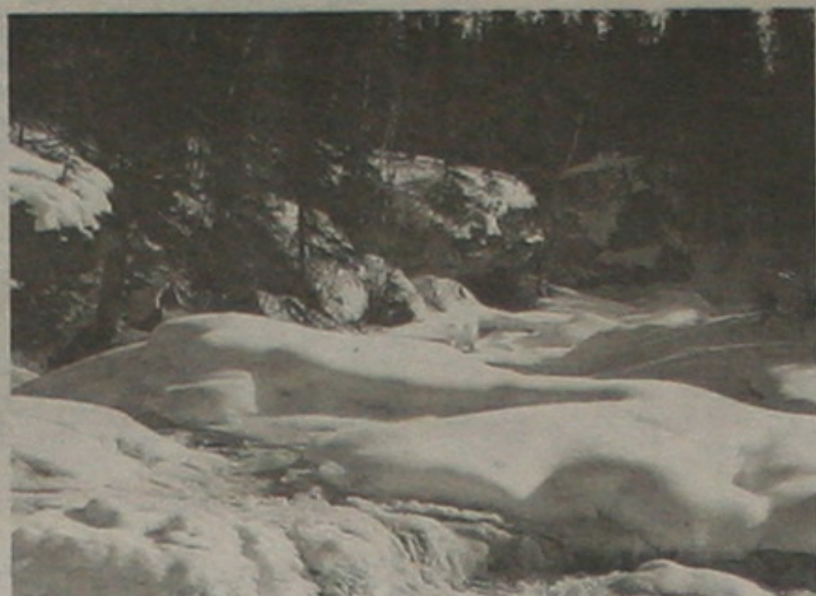
White Mud Falls, Alberta, in winter white cover.

Regular public education protests occurred and information was handed out, on the street in front of the