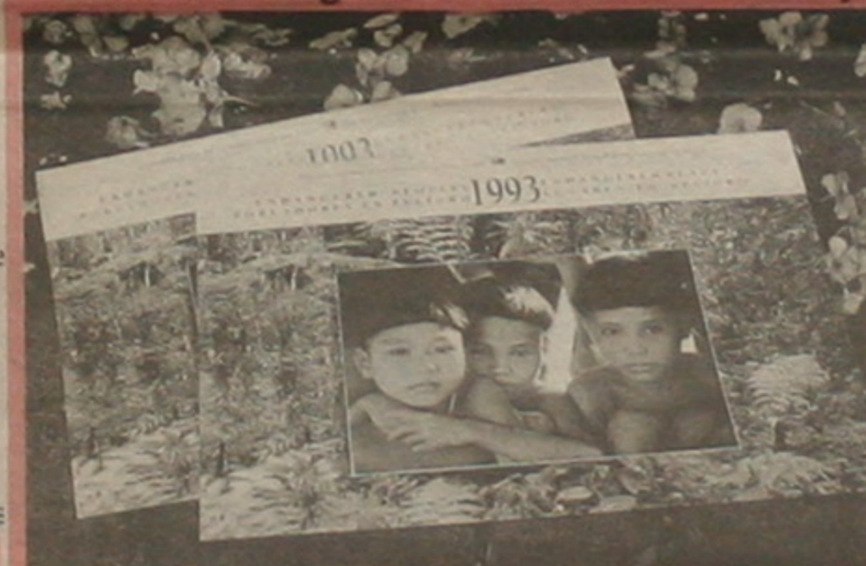
Endangered Peoples - Endangered Places wall calendar. Proud achievement of the WILD Campaign. J.P. LeFrank

Early in 1992 WILD began intensively working on a project which has long been a dream: an international calendar to raise global awareness of the connection between Earth's biological and cultural heritage.