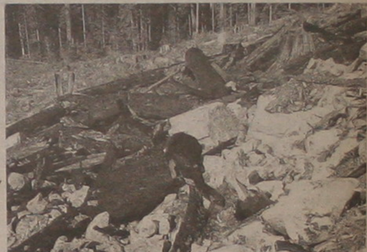
Logging damage in Coquitlam Watershed, September 1988.

supply valleys, where clearcut logging is happening as you read this paper. The GVRD has given its approval for seven new clearcuts in the Capilano and Seymour watersheds. * What you should do - Write mayor Gordon Campbell, Chairman of the GVRD, GVRD, 4330 Kingsway, Burnaby, B.C. V5H 4G8 * Local environment group needing support - Environmental Youth Alliance, Box 34097, Vancouver, B.C. V6J 7M1. Phone (604) 737-2258.