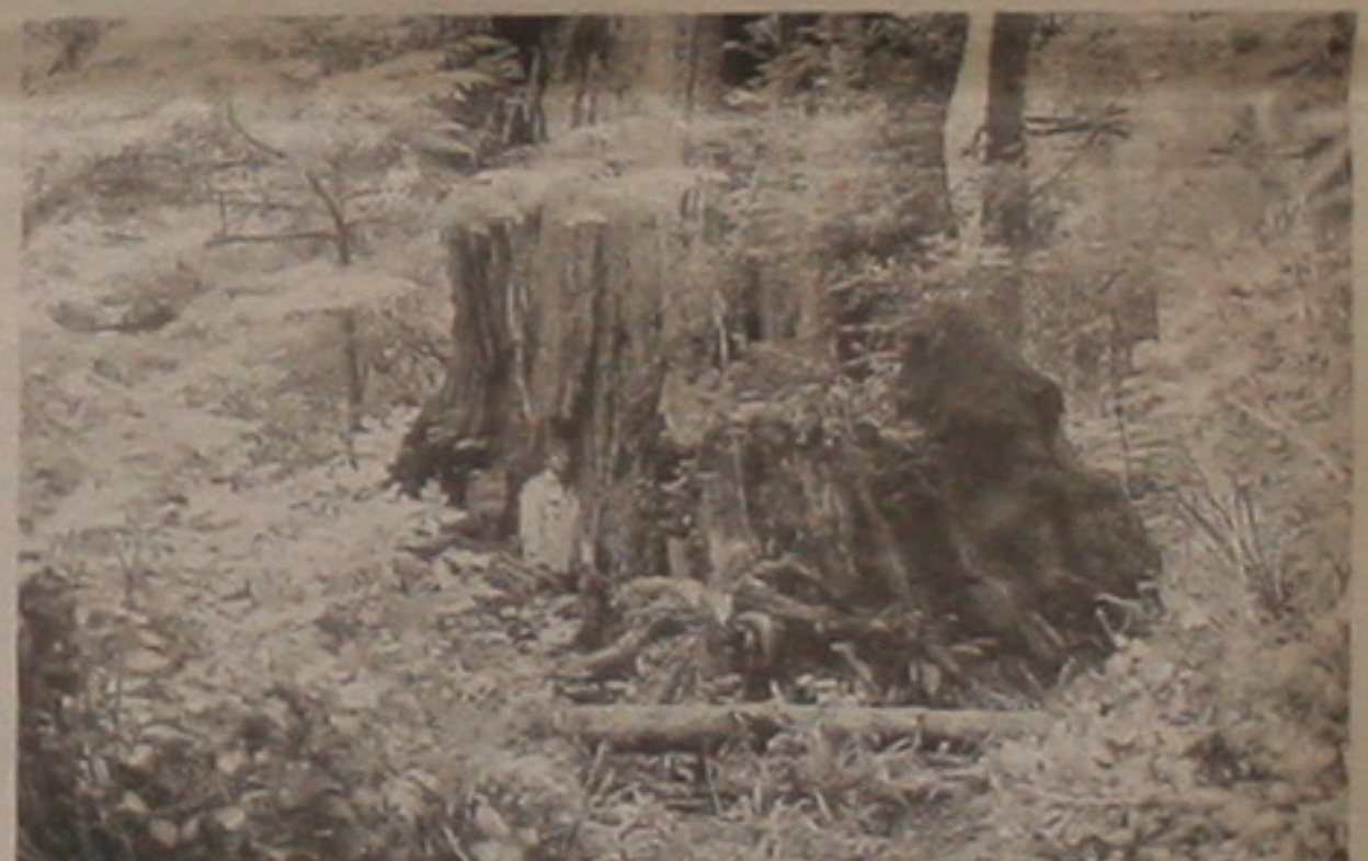
"Hanging Garden Cedar, Meares Island, Clayoquot Sound. Leo DeGroot

*'92 highlights - Clayoquot Sound has become the centre of the storm in the fight to save Vancouver Island wilderness. Once again, this year, there were arrests in Clayoquot Sound as local people peacefully blockaded logging roads in an attempt to protect their local wilderness areas. The Wilderness Committee printed 100,000 copies of a full colour, four-page information report on Clayoquot Sound. Our members have responded by writing to Premier Harcourt in very high numbers, asking that Clayoquot Sound be given Biosphere Reserve protection. * '93 directions - Clayoquot Sound is the crowning jewel of the Vancouver Island preserved wilderness network that will be proposed to CORE by the Vancouver Island environmental groups. WCWC will continue to publish and