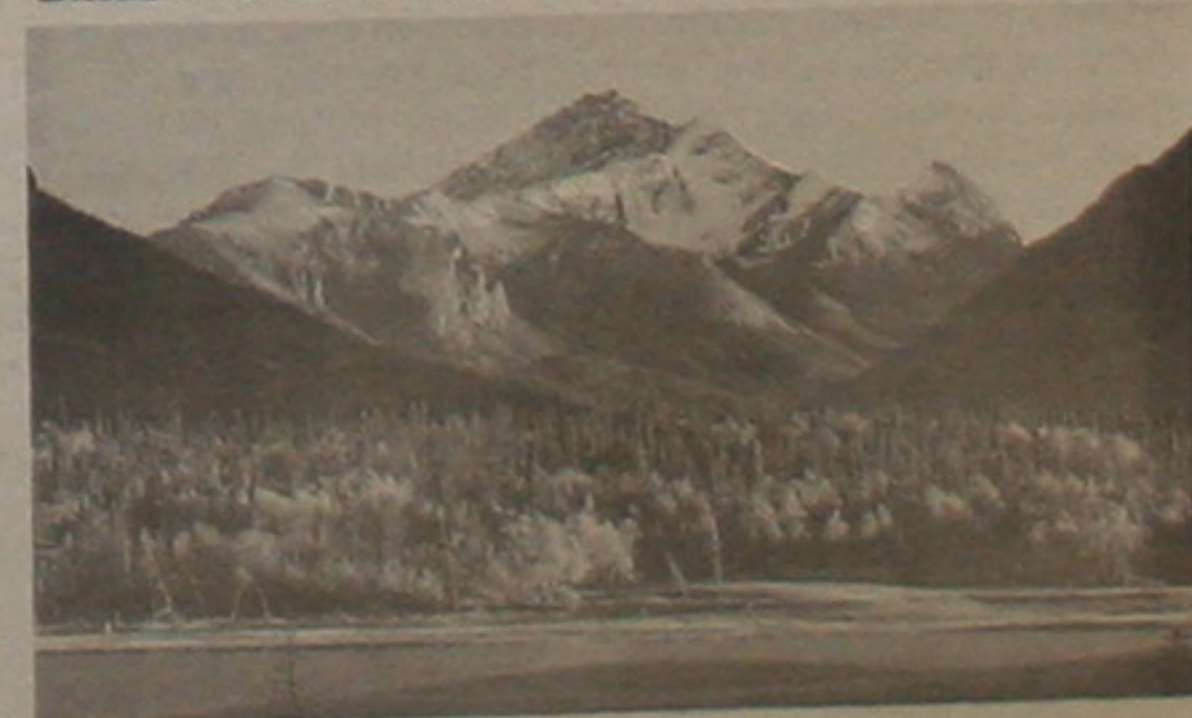
Mount Tatlow, Nemah Valley. Gary Flegehen