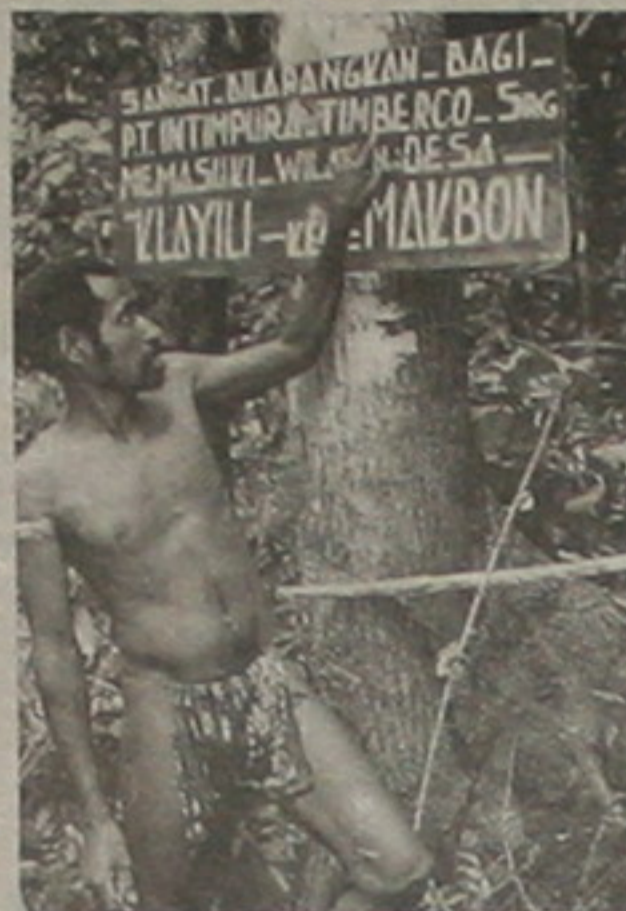
Irian Jaya Native beside "Loggers keep out sign" that his tribe posted on territorial boundary.

Our priority over the next few months is publication of a new Penan campaign newspaper. Our first two papers (150,000 copies) are all gone. Concerned people around the world are constantly requesting an update as, globally, this issue remains at the forefront of indigenous rights/tropical rainforest preservation campaigns. Your help and continued support are needed. If we are unable to win this campaign, what chance is there for the rest of the world's tropical rainforests? Please call us at (604) 669-9453.