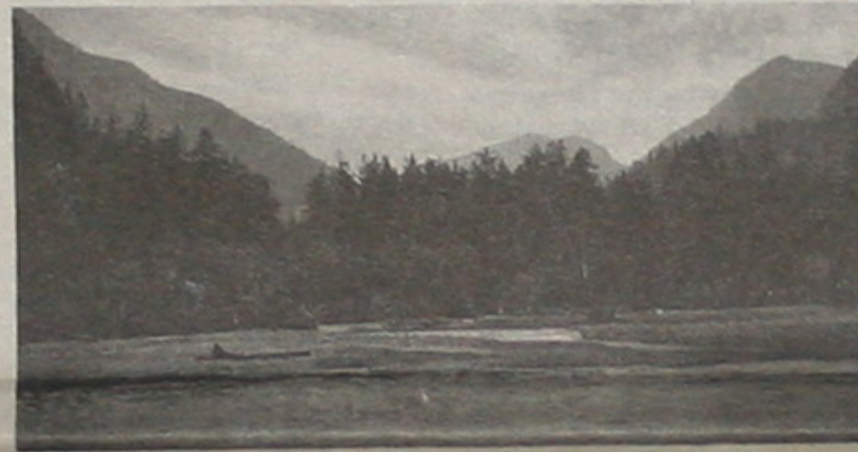
Old Growth forest along lower Tsitika River.

* '92 highlights - After a hard-fought campaign waged by a number of native and environmental organizations, including WCWC's Victoria Branch, the B.C. government announced this spring that a five year logging moratorium would be placed over the Lower Tsitika Valley and the adjoining Schmidt Creek Valley. WCWC produced a video (see WCWC catalogue) about the long, tough fight that has led up to the moratorium. * '93 directions - WCWC will work to see Catherine Creek added to the logging moratorium area. As well, we will push to see the Lower Tsitika and Catherine Creek areas become protected wilderness under the Vancouver Island CORE process. Our recently produced video will be distributed throughout Europe and the USA as well as across Canada.