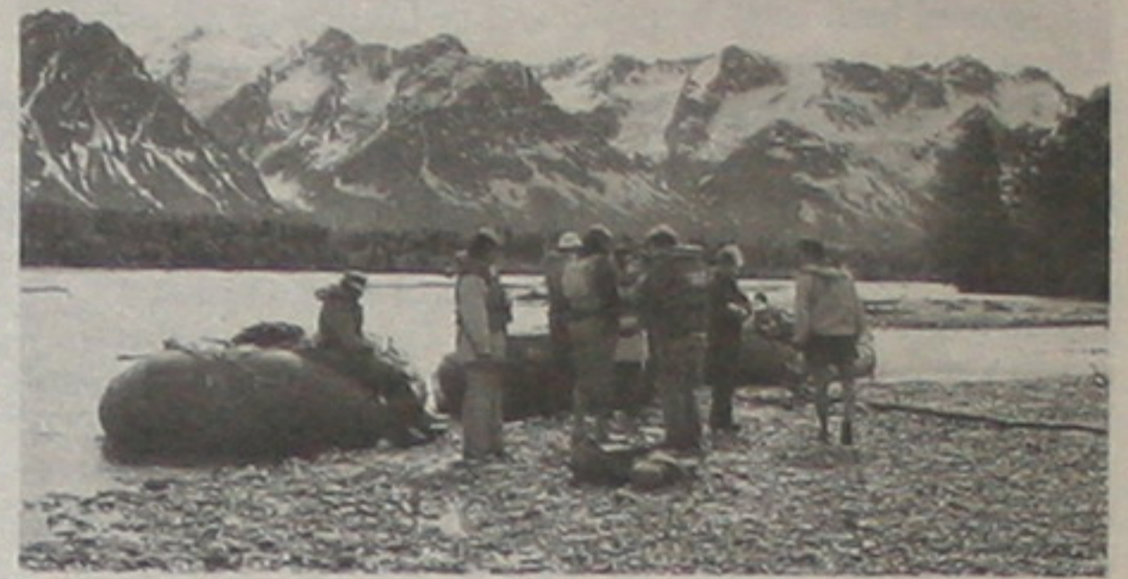
Tatshenshini Expedition. Adriane Carr

to have CORE investigate the claims of the mining company. * '93 directions - Look for increasing pressure to put a stop to the mine plans based on the huge risk from acid mine drainage. The Alaskan fishing industry would be at great risk if the Canadian mine plan goes ahead. Expect to see the USA becoming a strong advocate for the international park. WCWC will continue its mass education program with more Tatshenshini publications.