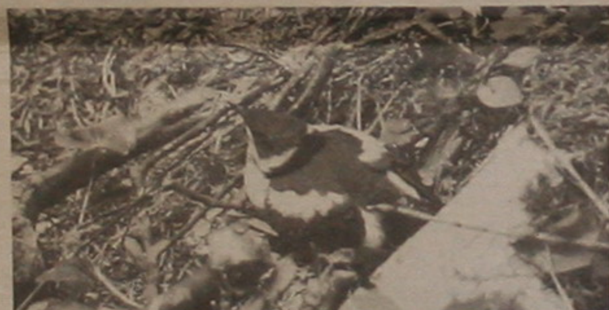
Marbled Murrelet Chick found on forest floor in Carmanah Valley, Summer.