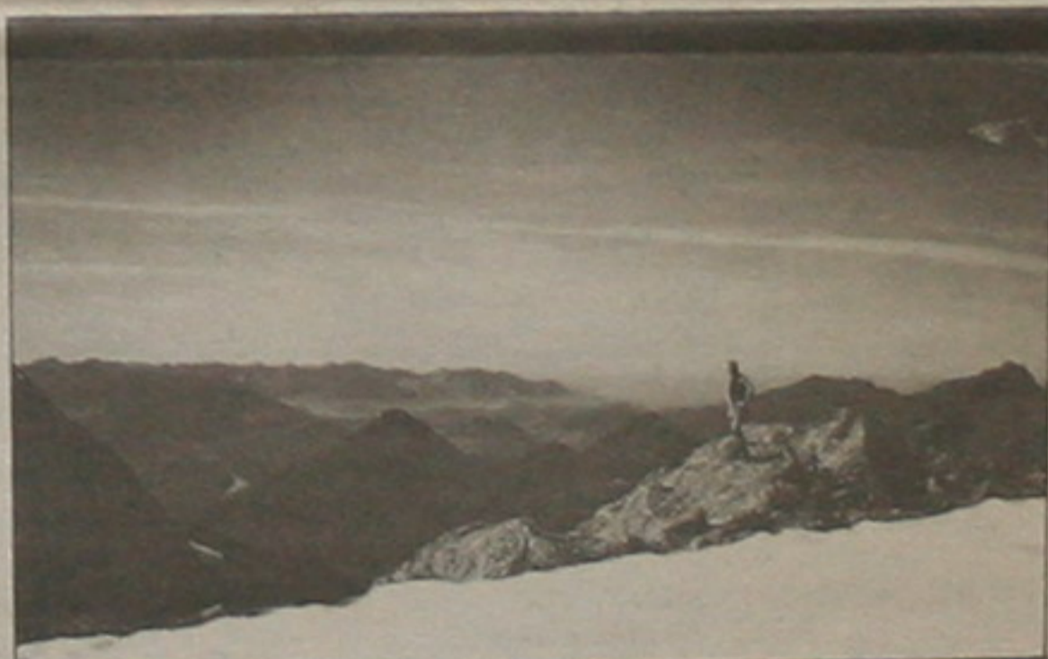
View from the top of the Backbone Trail in Strathcona Park.

The proposed route is as follows: from Victoria we plan