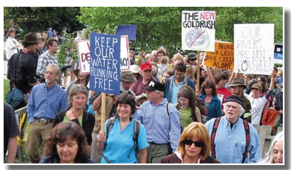
Protest against controversial private power proposal in the Kootenays

The 2002 policy triggered a gold rush where today we have almost 800 creeks, rivers and lakes staked by private power corporations.<sup>2</sup> Wild creeks and rivers such as Big Silver, Kokish and the Upper Lillooet are slated to be turned into private river diversion projects. The environmental impacts have led the projects to be called "ruin-of-river" because up to 95 per cent of the mean annual flow of the river is diverted into a pipe – the water remaining in the original river bed can be