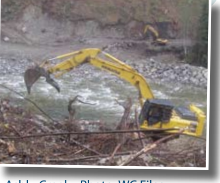
Ashlu Creek

Surely we can learn from the Tyson Lake disaster and ensure that lakes aren't turned into private holdings for power corporations. Right now, other lakes have been staked by private power companies including Phantom and Ramona Lakes on the Sunshine Coast, Slollicum Lake, Wilson Lake and Salsbury Lake in the Fraser Valley and a collective of unnamed lakes above Jervis Inlet.