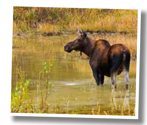
Photo top: Sunrise in Duck Mountain Provincial Park, above: Moose.

The Wilderness Committee is advocating for 20 per cent of Manitoba to be protected by the year 2020. So far, just over 10 per cent of the province has been protected. A healthy future depends on preserving Manitoba's natural heritage, and to reach our goal, we'll have to work together.