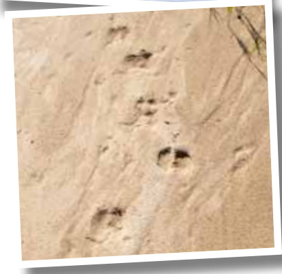
Photos above: Snowshoe hare, Caribou tracks.