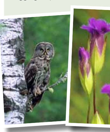
Photo left: Great grey owl, right: Fringed gentian.

Four out of the five have taken significant strides towards protection, thanks to support from people like you. Much of the Saskatchewan River Delta remains temporarily off-limits to logging, as protected status is still