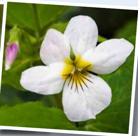
Photo left: Horned grebe right: Canada violet.