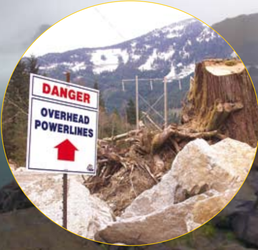
Ashlu Creek private power project