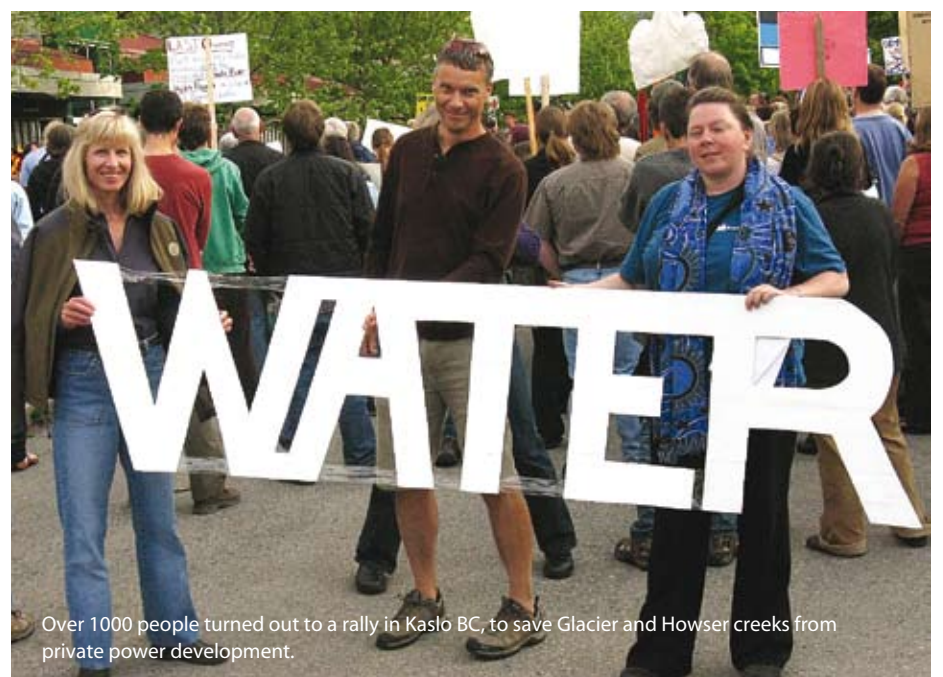
Over 1000 people turned out to a rally in Kaslo BC, to save Glacier and Howser creeks from private power development.