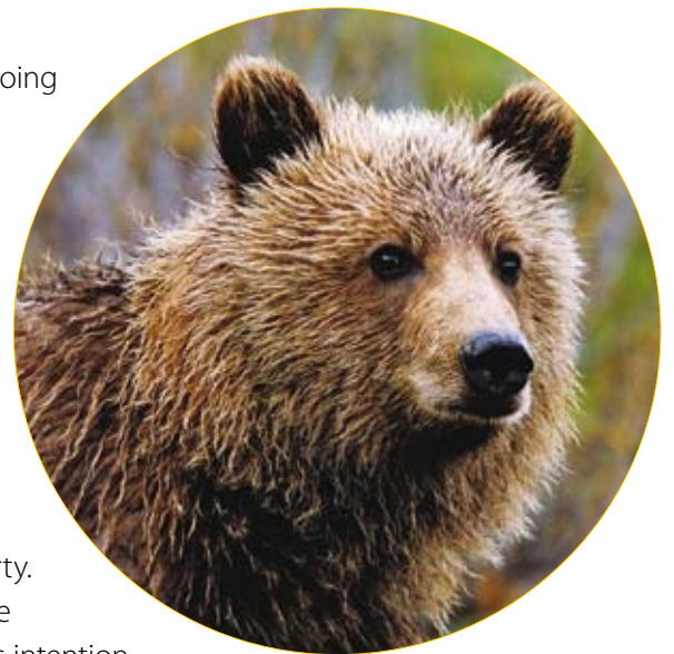
Grizzly bear habitat in the Kootenays would be negatively impacted by the proposed Glacier/Howser private power project.

At the time this paper was going to press the BC government announced in its throne speech that it would overrule the BC Utilities Commission – its own independent watchdog – a move widely seen as a move to prop up the fortunes of private power companies, many of which help fund the governing party. Perhaps more ominously, the government also signaled its intention to export private power.