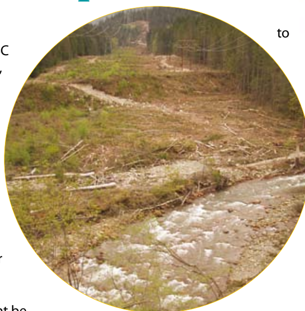
Power line corridor cut down to stream banks near Harrison Lake.