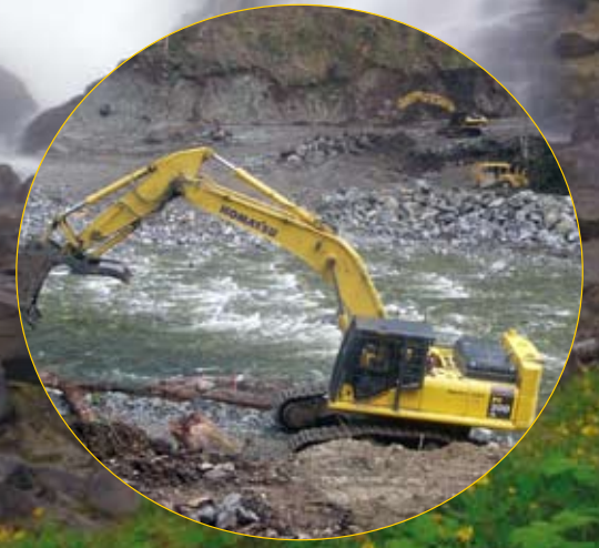
Excavator at Ashlu Creek private power project

Over 800 rivers and creeks in BC, like the Morkill River (East of Prince George), are staked for private power development.