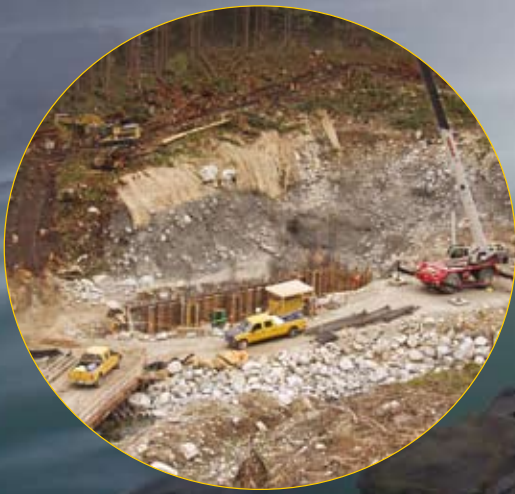
Private power construction site near Harrison Lake.