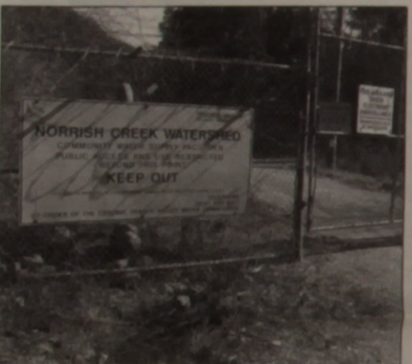
Do you know what's going on in your water supply area? Behind locked gates logging companies and other industrial users have free run of the watershed.