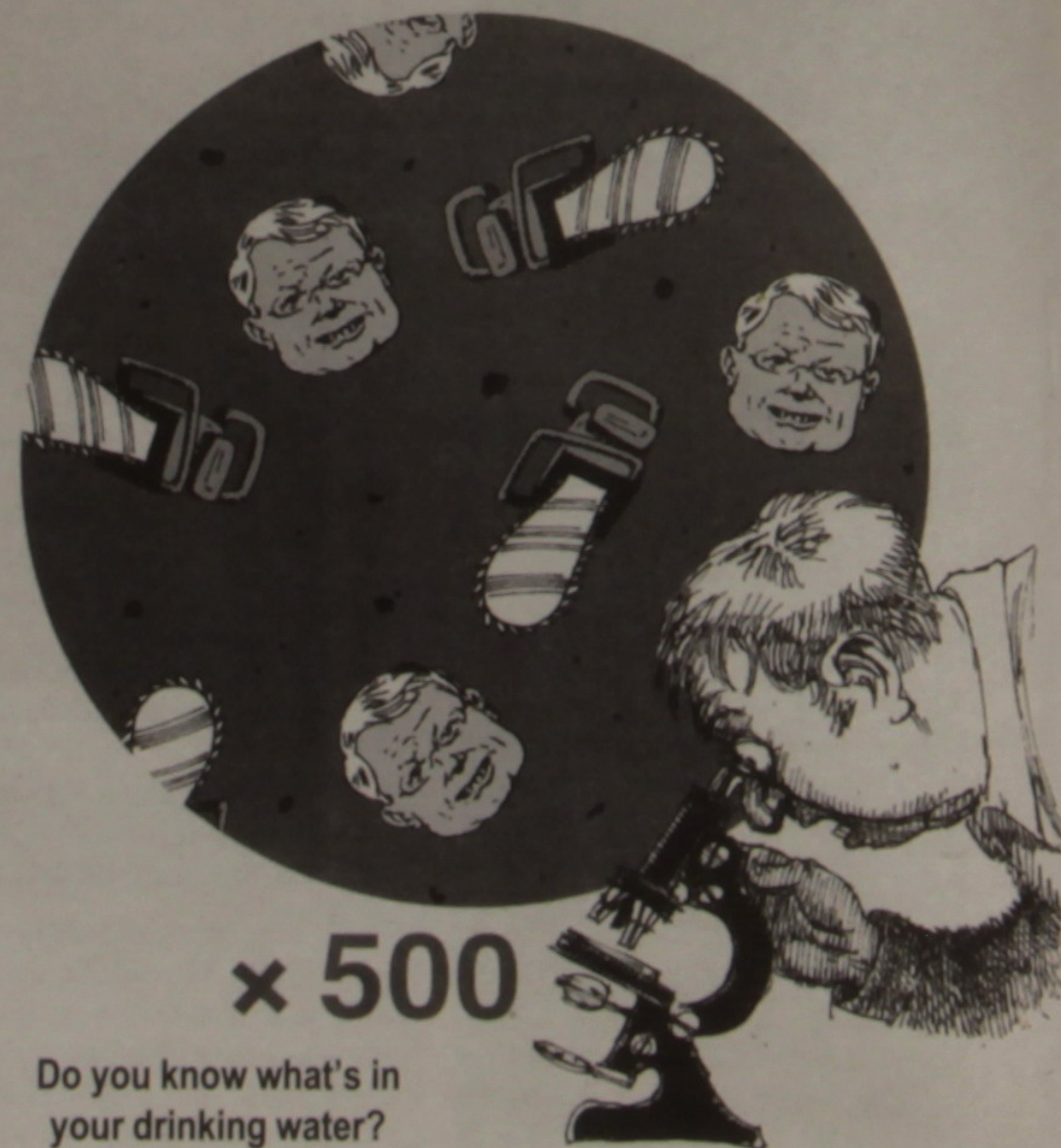
Do you know what's in your drinking water?

Coupled with other recent legislative changes that gut environmental protection and monitoring, and the government's determination to sell off public resources to the highest bidder, there is now a significantly heightened risk for degraded water quality and water-borne disease outbreaks to communities throughout the province. Victoria and Greater Vancouver have a 99-year lease to protect their drinking watersheds. No other BC municipality has such protection. All British Columbians deserve the same rights of Greater Vancouver and Victoria citizens to protect their watersheds and drinking water quality from the effects of logging and other industrial activities.