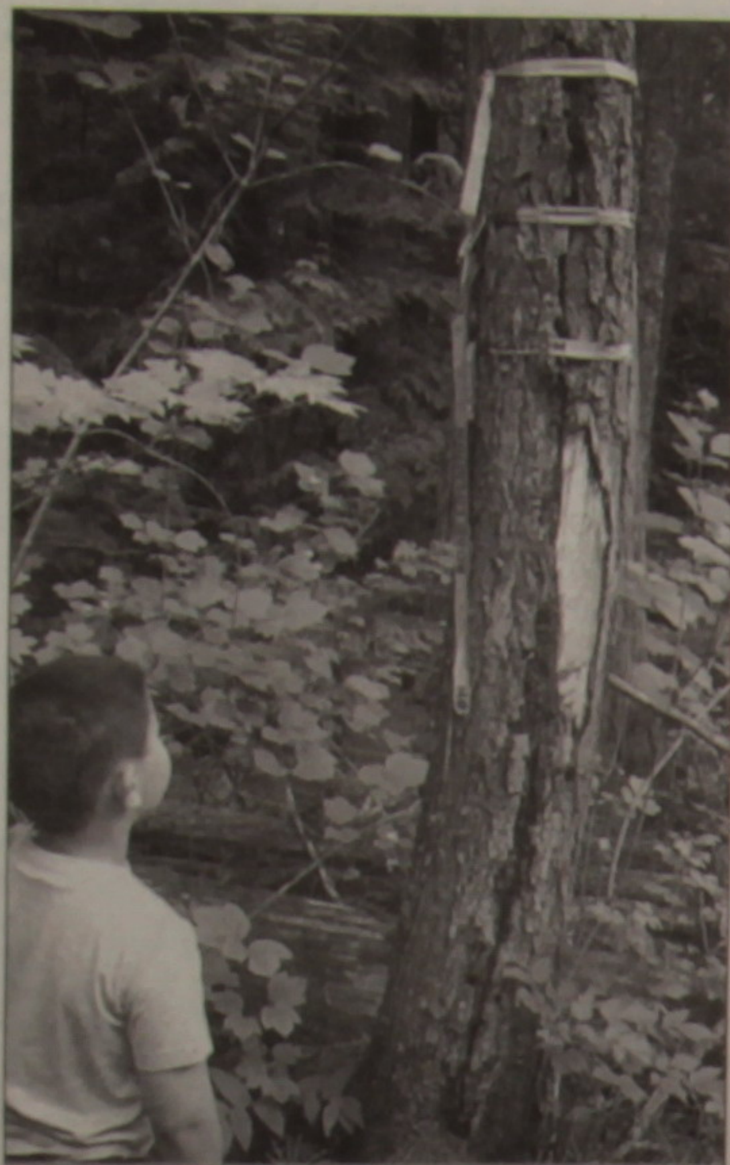
Interfor has already slashed out and marked their proposed logging road location in Manning Park.