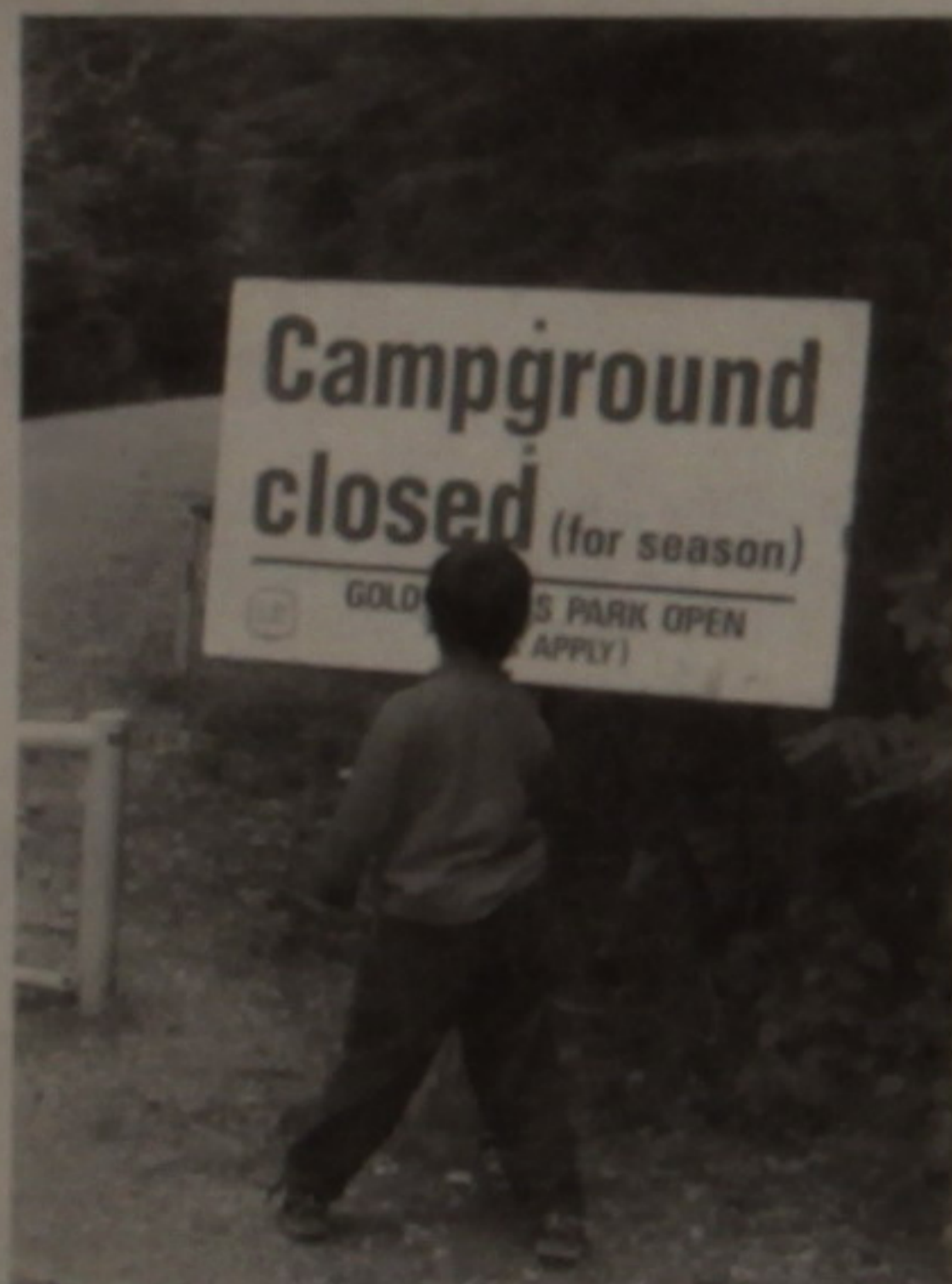
Many campgrounds from all regions of BC have been closed.

Inside, read about ways to you can take action to help protect Beautiful BC!