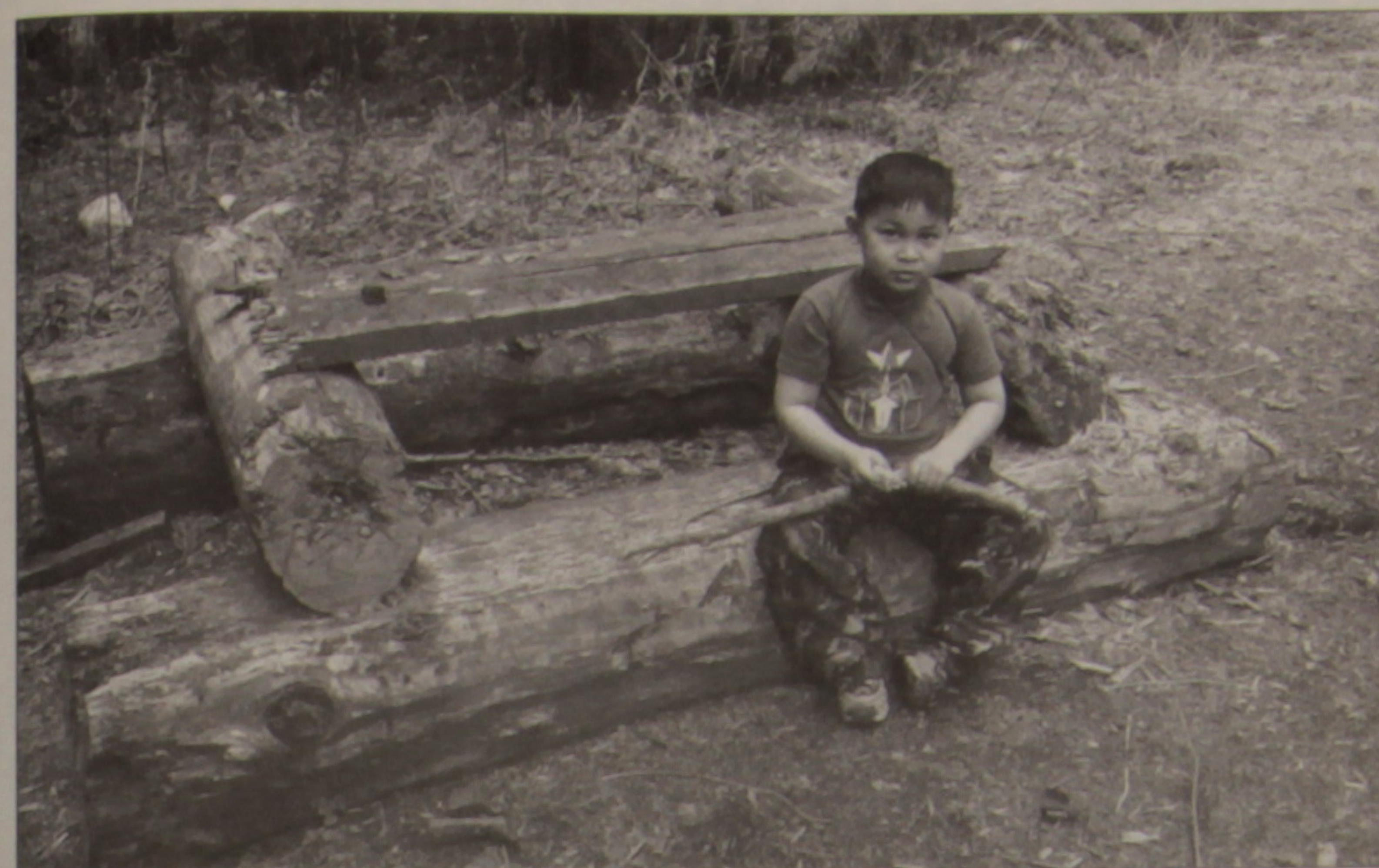
Campers searching for firewood have already destroyed this Forest Service picnic table. Expect much more of the same as a result of Liberal cost-cutting in the parks system.