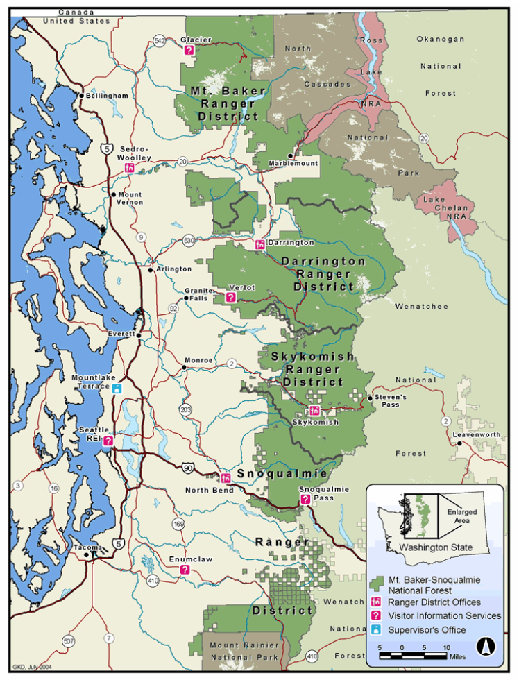
Map 3: National Forest and National Recreation Area Boundaries