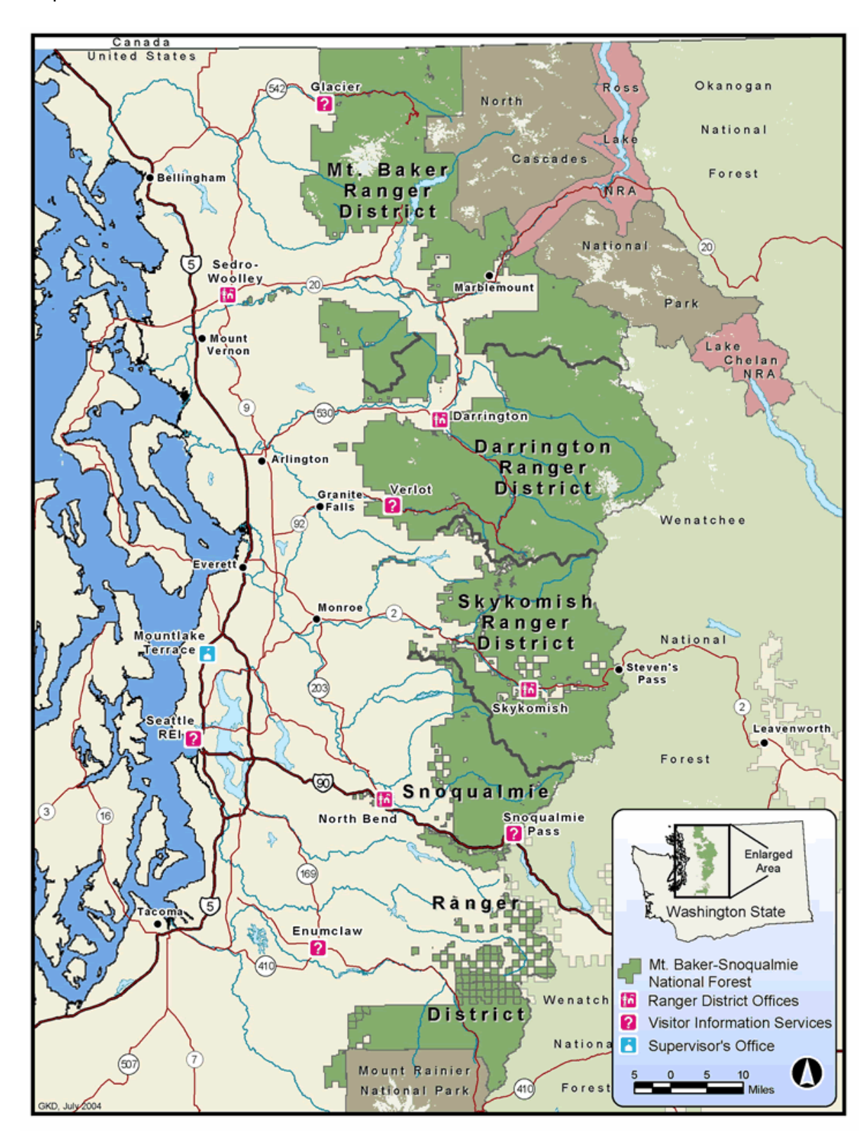
Map 3: National Forest and National Recreation Area Boundaries