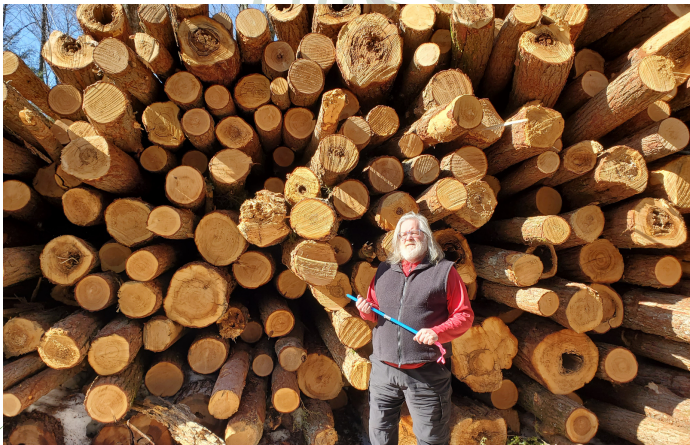
Image: from March 2021-AFER lead ecologist with harvested hemlock logs — hemlock is one of the least profitable of timbers.

The CFSC believes more logging will compromise the potential for the forest to reach an old growth state and the associated carbon sequestration, habitat, education and recreation values. While hemlock can grow to 600 years of age, logging will stunt this ability and likely encourage regrowth of more "profitable" timber species such as pine and hardwood. This is partly why old hemlock forests are so rare.