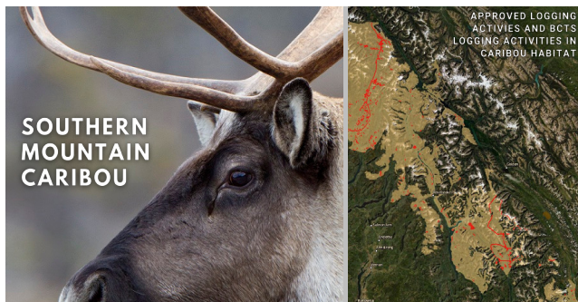
SOUTHERN MOUNTAIN CARIBOU