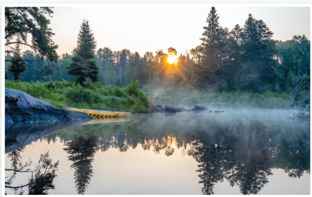
Photo: Rice River falls, Hollow Water First Nation, MB.

Having nature around all of us has also been shown to improve our health.<sup>27</sup> With health spending accounting for a massive chunk of government spending, adding protected areas is a wise public health investment.<sup>28</sup> When we add protected areas near schools, we provide opportunities for the next generation to become educated first hand about the interconnected