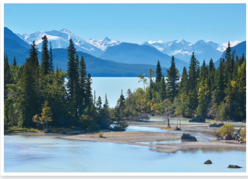
Photo: Dasiqox Tribal Park, Tŝilhqot'in territory, B.C. (Jeremy Sean Williams).

A future where species continue to go extinct as more and more of their habitats are destroyed is a bleak and dangerous one. Reversing this trend requires more than just doubling the amount of area off-limits to industrial development. We need to come together and reimagine our relationship with nature and the species we share this planet with,