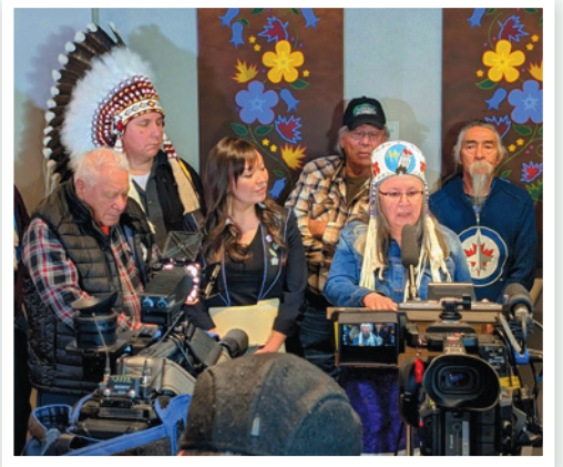
Photo: Chief Shirley Ducharme, O-Pipon-Na-Piwin Cree Nation at the announcement of mining withdrawals from the Seal River Watershed.

areas of interest. On separate mapping projects, areas First Nations nominated were listed. Having this information available, with a large list of projected new protected areas, creates accountability for governments and lets the public assess progress towards our global goals.