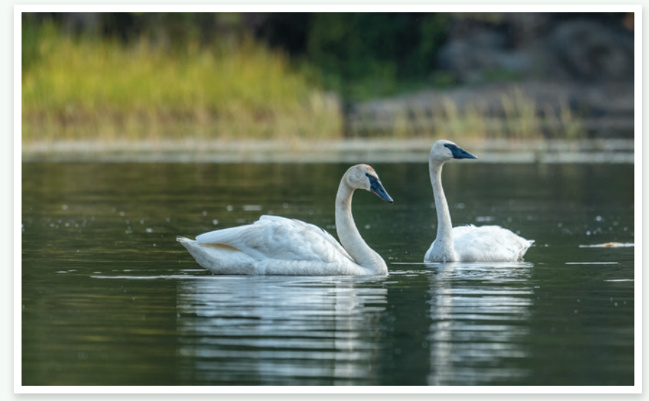
Photo: Trumpeter swans, lower Bird River, Sagkeeng First Nation territory.

web of life and our dependence on it. Folks raised with this nature exposure will be better equipped to care for biodiversity in the future.