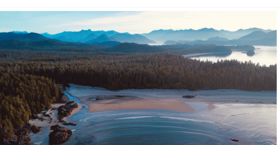
Photo top: Wenosaga Rapids on the Wenosaga River, Ear Falls, ON. Near Grassy Narrows and Lac Seul First Nation Territory. Yellow-banded bumble bee. Northern leopard frog Photo bottom: Flores Island, Saahuus?ath First Nation territory, B.C.