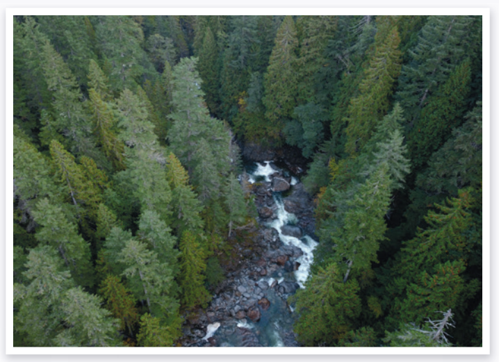
Photo: Spô'zêm Valley Wildlife Habitat Area old-growth forest, Spózem First Nation territory, B.C. (Joe Foy).