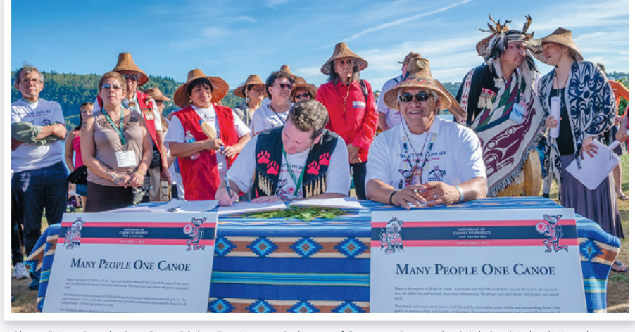
"Many People, One Canoe" Salish First Nations Gathering of Canoes to Protect the Salish Sea.

Support for Indigenous rights and the return of land to Indigenous People cannot be limited just to Indigenous Protected and Conserved Areas (IPCAs), but must be extended to the rest of a nations' territory as well. If provincial, territorial and federal governments are going to look to Indigenous nations as leaders on the path to meeting targets on biodiversity and climate change, they must also return land, jurisdiction and decision making powers to First Nations, Inuit and Métis governments more broadly to ensure they benefit from their territories both inside and outside IPCAs.