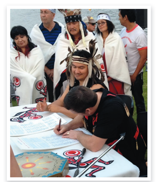
Photo: Skwx wú7mesh and səlilwətał Nation sign the Save the Fraser Declaration.

contact our provincial governments and call on them to commit to a 30x30 target and lay out a plan for a rapid and just expansion of Indigenous-led protected areas to get there.