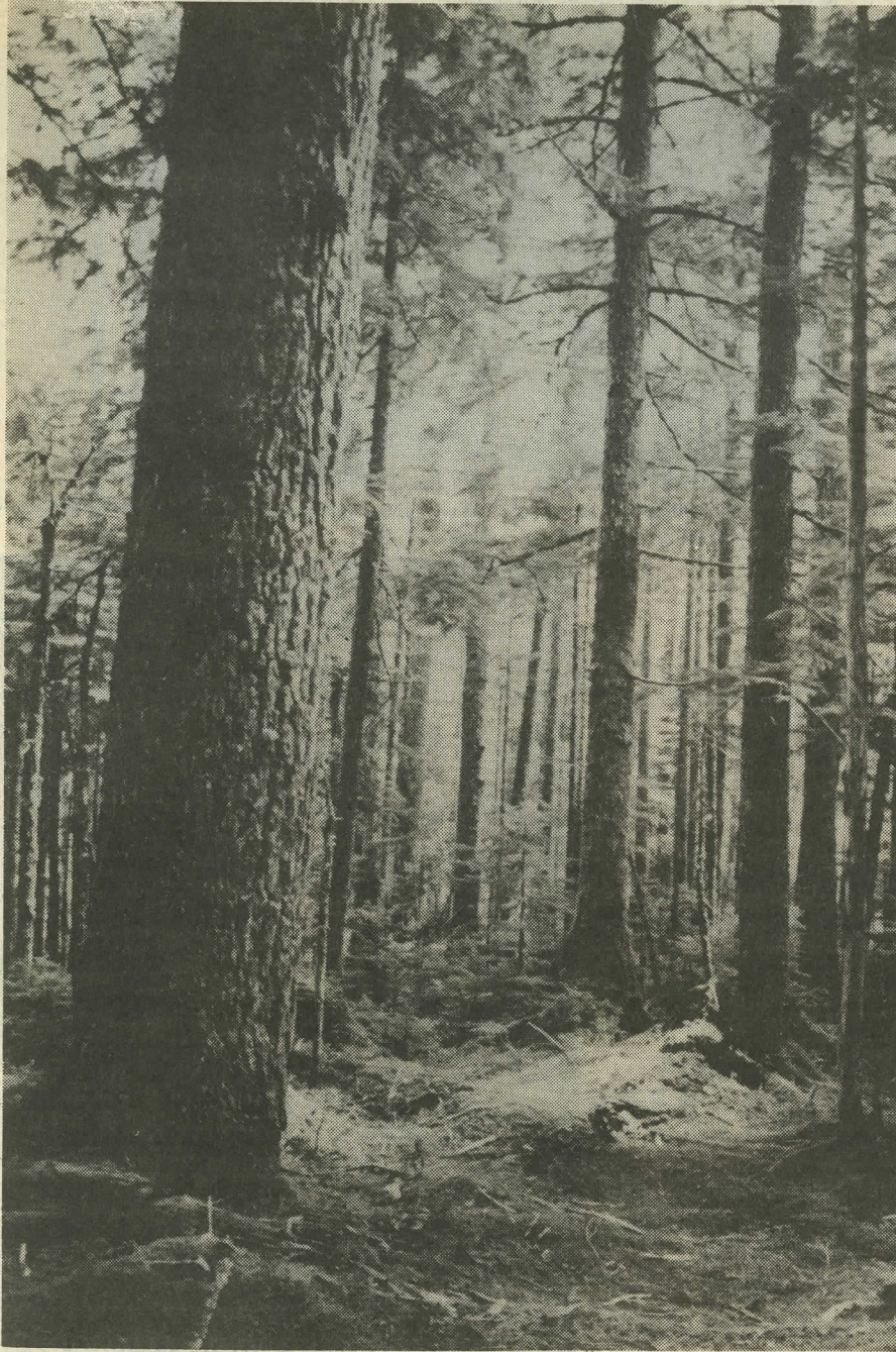
Favoured nesting sites for marbled murrelets, Western and Mountain hemlocks 600-1000 years old dominate much of the Caren Range Upland forest.

Photo above: Canada's oldest known tree: sixty five generations of people came and went during the life time of this 1700 year old yellow cedar before it was logged five years ago. Remnant ancient forest nearby need urgent action to avoid a similar fate.