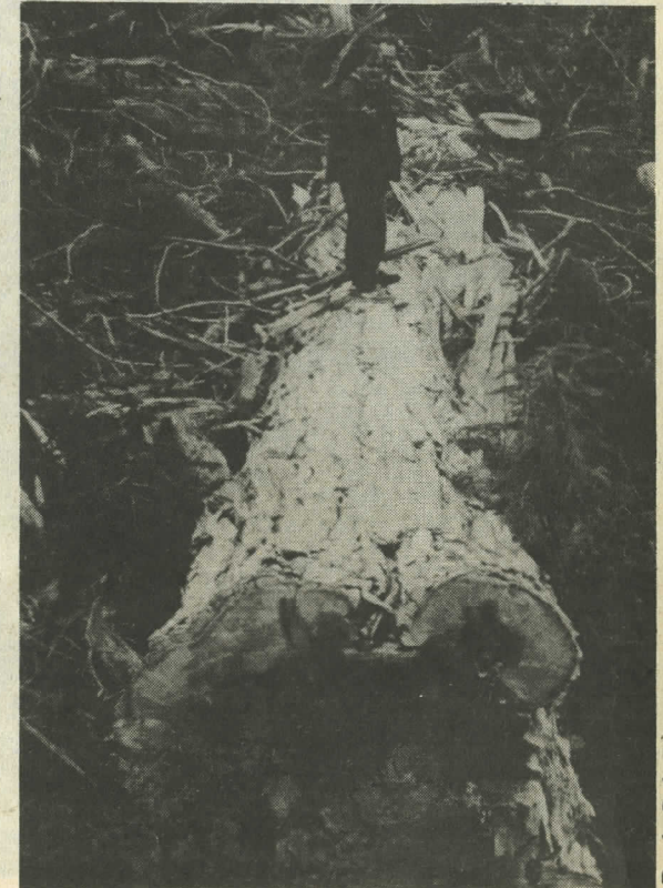
1,513-year-old yellow cedar left as waste wood in Caren Range Uplands.

Down stream erosion was severe when heavy rains combined with snow melt from clearcuts to send Lions Creek on a rampage in November of 1991.