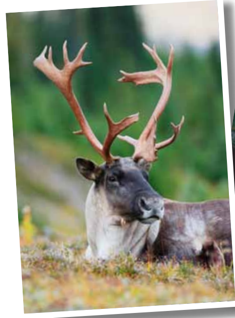
Photo left: Mountain caribou, right: Black-capped chickadee.

The critical report found that ecological plans for parks and protected areas were outdated or non-existent, conservation policies were lacking and that many protected areas were too small and fragmented to support biodiversity. The Auditor General also found that several biogeoclimatic zones, such as the critically endangered Douglas-fir ecosystem, remain "significantly underrepresented" in the protected area system.