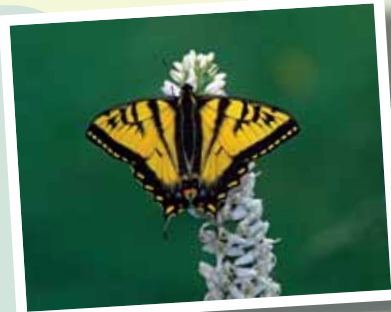
Photo: Tiger swallowtail in Wells Gray Provincial Park (Mike Grandmaison).

"At this time I am unable to secure the necessary resources to fix the outhouse at Confederation Lake. In the short-term I think we should close the outhouse... the outhouse floor is about to collapse and could cause serious harm to the unfortunate user..." – BC Parks Staff 15