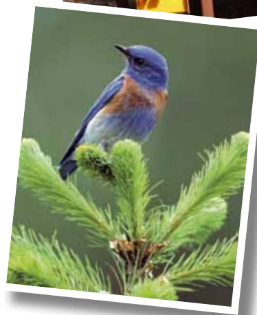
Photos above: Parking meter before removal, Western bluebird.