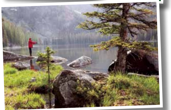
Photo top: Garibaldi Provincial Park, above: Alpine meadow in Wells Gray Provincial Park. Fisherman at Quiniscoe Lake, Cathedral Provincial Park.

Despite these troubling developments, all is not lost. With vision, planning, commitment and proper funding we can ensure that our provincial park system regains its leadership role in North America.