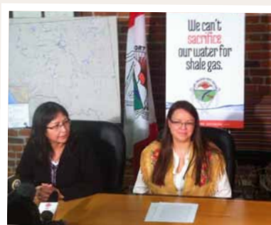
Photo: Fort Nelson First Nations hold a press conference about fracking shale gas.

Radioactivity created by fracking is only now starting to be researched. A recent report revealed that a cocktail of radioactive agents is set free by fracking operations. 7 In order to track the location and success of fracking bore holes, it is sometimes necessary to inject radioactive tracers into the fracking fluid. The gas industry remains shrouded in secrecy, and does not release the information required to determine the level of public threat.