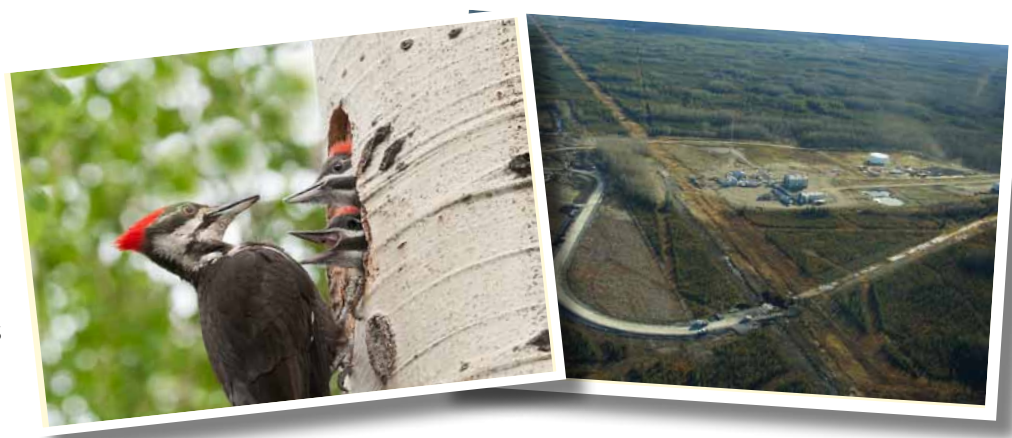
Photo top: Moose in Muskwa-Kechika, BC, left: Pileated woodpecker family, Gas well site.

WHAT IS FRACKING? Hydraulic fracturing involves injecting thousands of gallons of water – mixed with sand and laced with hazardous chemicals like benzene – into small drilled wells at high pressure. This process "fractures" hard shale rock formations to release the trapped gas.