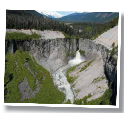
Photo top: Boulder Creek, one of three creeks being developed in the Upper Lillooet valley, above: Keyhole Falls.

Fortunately, several recent (and surprising) developments have changed the dynamics around the race to dam and divert our wild rivers.