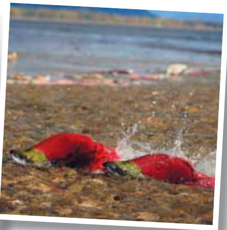
Photo above: Grizzly bear, BC, right: Sockeye salmon, Adams River, BC.