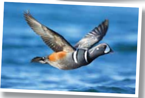
Photos above: Logging at the Upper Lillooet Hydro Project, Harlequin duck.

River diversion projects have been heavily criticized because of their environmental footprint, rate impacts, high levels of non-compliance and significant impact to the financial viability of BC Hydro.