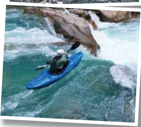
Photos from top: BC coastal waterfall Private power project on the Kokish River, Kayaking on Ashlu Creek (above the dam)

"If those projects come online, we will have to take electricity produced at $100 or $125 MWh and sell it on the export market. Export markets are very unattractive right now. By deferring or terminating by mutual agreement some of these contracts, we are looking to resolve this issue."