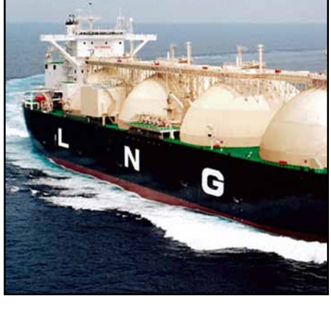
Photos: Grizzly bear with cubs (Paul Burwell), Sockeye salmon (Isabelle Groc), LNG tanker (Creative