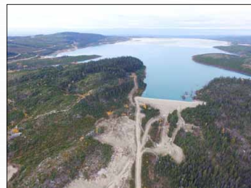
Photo: Gibraltar Copper-Molybdenum Mine tailings pond.