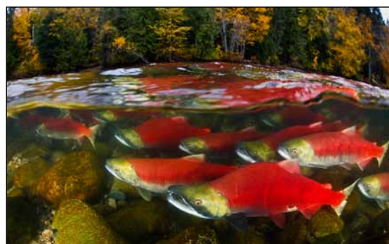
Photos left to right: Hazeltine Creek, post-Mount Polley mine spill, wild sockeye salmon.

Read on to find out how we can work together to clean up BC's dirty mining industry.