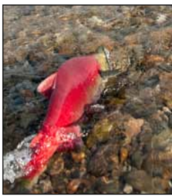
Photo left: Wild sockeye salmon in Adams River, BC, right: Devastation after the Samarco mine disaster in Brazil.

The river was already suffering by 1964, when the Mt. Washington Copper Company set up in the upper Tsoolum watershed.