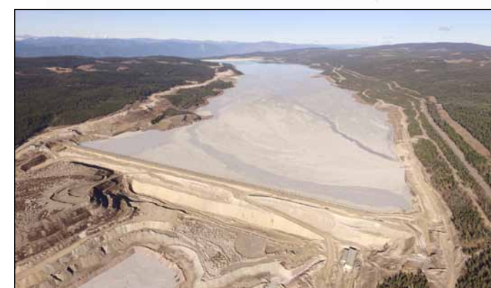
Photo: Highland Valley Copper Mine tailings pond (Jeremy Sean Williams).