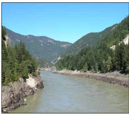
Photo left: Copper Mountain Mine tailings pond, right: Fraser River, BC.